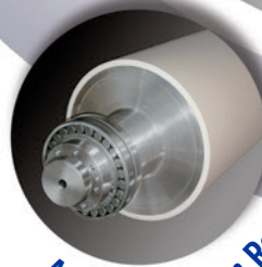
Adhesive Layon Rollers