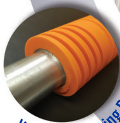
Wrinkle Removing Rollers